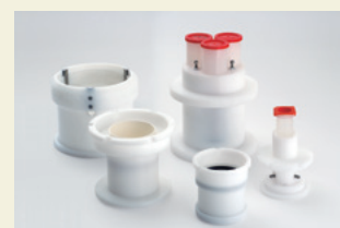
Wide range of adopters